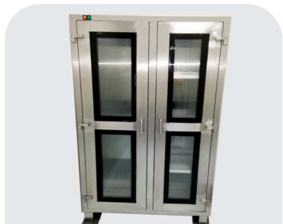
GARMENT CABINET (STATIC / DYNAMIC)

The filter cleaning booth features two essential components: the Filter Cleaning Station and the Wet Scrubber with a Venturi system and exhaust. This integrated system provides a safe and controlled environment for filter maintenance, maximizing efficiency and compliance with air quality regulations."